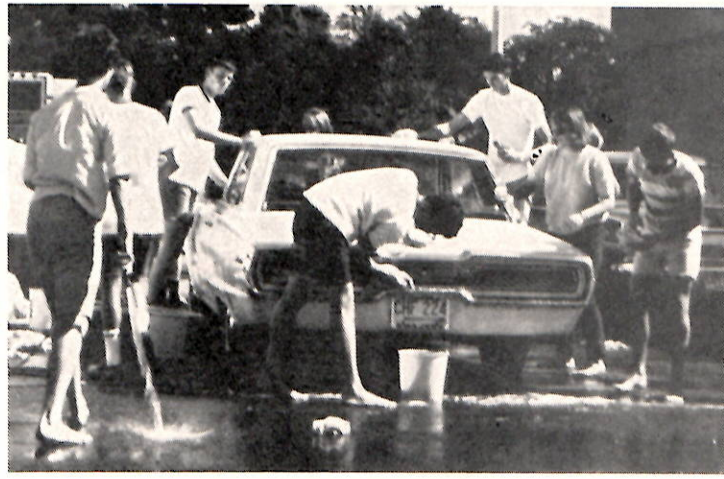
THESE PEP CLUB and Spirit Committee members are shown working industriously at their recent car wash.