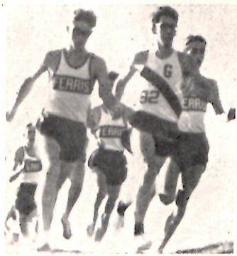
Ferris runners grabbed an early lead on their way to a sweep of Gonzaga.